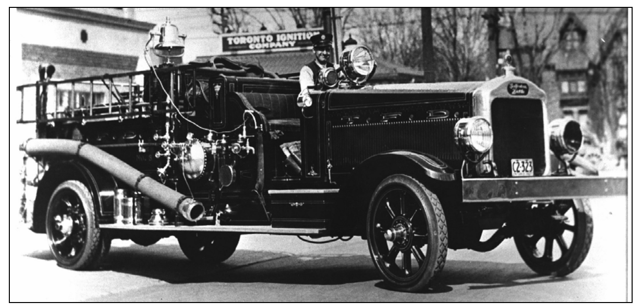
Pumper 8, a 1927 Gotfredson-Bickle photographed in 1932.