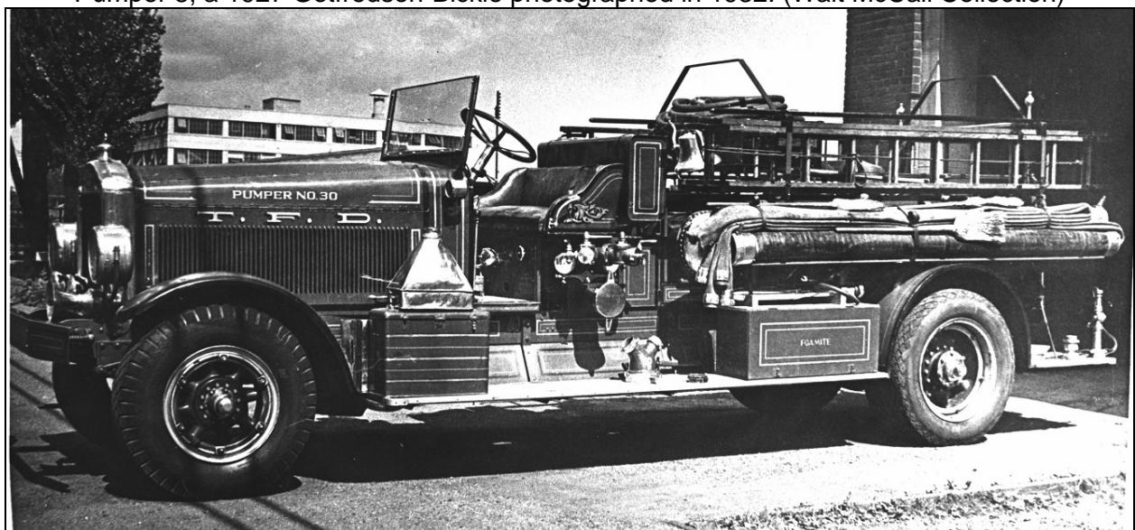
Pumper 30's 1927 Gotfredson-Bickle pumper in1954.